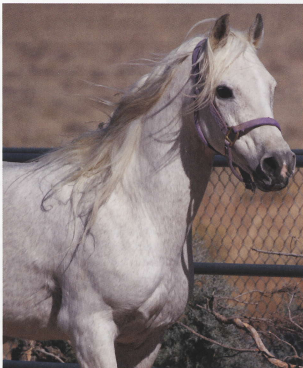
The Gai Trillo son Kings Trillomar (x Rose Of Azraff, by Azraff).