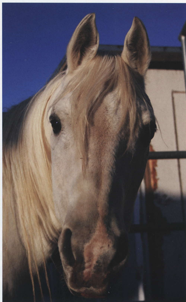
Facing page and above: Gai Trillo (Ferzon x Morningstar PHA Geyma, by Pharaff).

colt on the spot, and took him home. (At the time, Gainey Arabians' only location was the Owatonna, Minn., farm. Later a 2,200-acre ranch in Santa Ynez, Calif., begun in 1962, and a Scottsdale, Ariz., property would essentially replace the Minnesota original.)